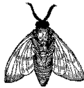
FIGURE 3: A sample black and white graphic that has been resized with the includegraphics command.

the input file ; again, it is instructive to compare the placement of the table here with the table in the printed output of this document.