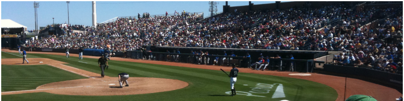
FIGURE 1: Ceci est un "teaser", c'est optionnel, vous n'en mettez un que si vous le souhaitez